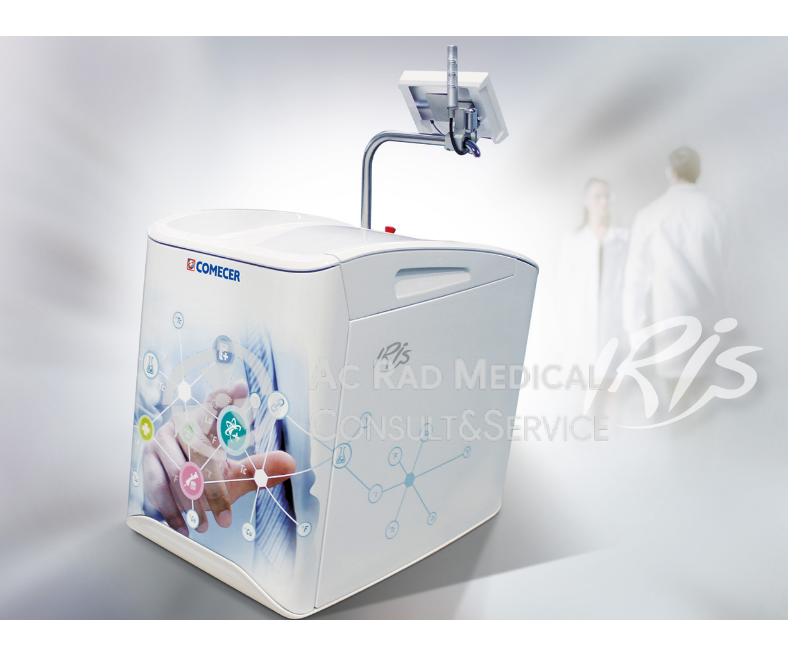
FLEXIBLE | ERGONOMIC | VERSATILE ...BEYOND TECHNOLOGY