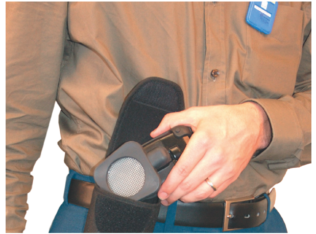
Holster for RadEye B20 versions. Order no: 425068519