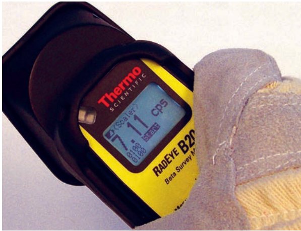
Can be operated with gloves